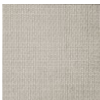
Body Fabric: 2810-35CC-P