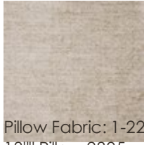
Pillow Fabric: 1-22''' x 18''' Pillow 2805- 35CC-P Performance