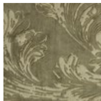
Pillow Fabric: 2-22x22 Pillows-Front 5148-53CC