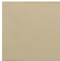
Whisper of Gold