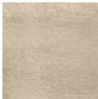
Soft Silver Leaf