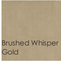
Brushed Whisper of Gold