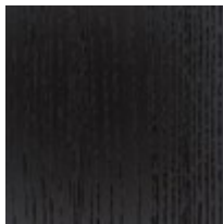
Black Stained Ash