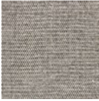
Body Fabric: 2793-92CC