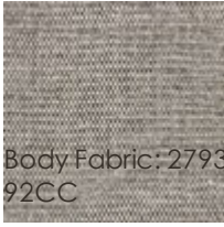
Body Fabric: 2793-92CC