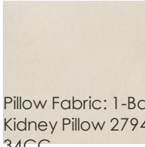
Pillow Fabric: 1-Back Kidney Pillow 2794-34CC