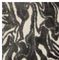
1-19" x 19" Pillow 8387-92CC