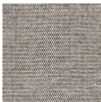
Body Fabric: 2793-92CC