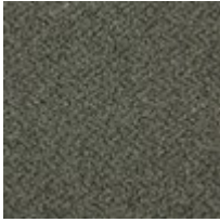
Pillow Fabric: 1-23.5" x 14.5" Back Pillow 2841-55CC-P