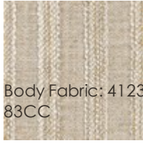
Body Fabric: 4123-83CC