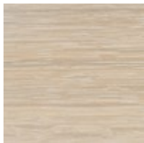
Sun Drenched Oak