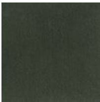
Body Fabric: 2997-56CC