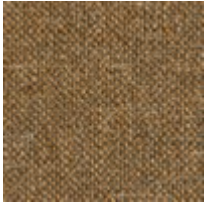
Body fabric: 2987- 30CC