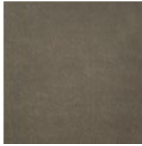
Body Fabric: Top Rail--2788-85CC-P Performance