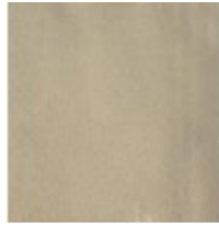
Top Fold--2788- 34CC-P Performance