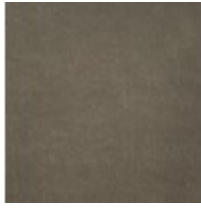
Body Fabric: Top Rail--2788-85CC-P Performance