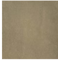
Middle Fold—2788-77CC-P Performance