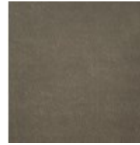
Bottom Fold—2788-85CC-P Performance