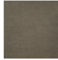
Bottom Fold--2788- 85CC-P Performance