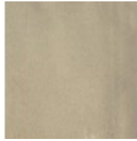
Top Fold—2788-34CC-P Performance