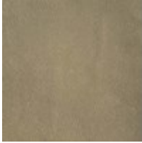
Inside Back and Seat Cushion--2788-77CC-P Performance