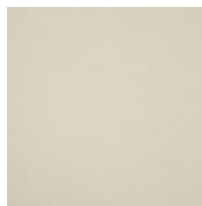
1-19" x 19" Pillow 2832-34CC

Pillow Fabric: 2-21" x 21" Pillows 2831- 71CC