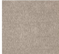
Pillow Fabric: 1-22''' x 19''' Pillow 3231-74CC