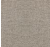
Body Fabric: 2778-71CC