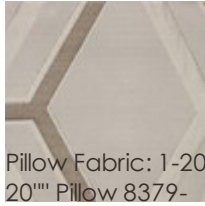
Pillow Fabric: 1-20" x 20" Pillow 8379-71CC