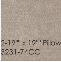
2-19" x 19" Pillows 3231-74CC