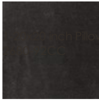
20x20 inch Pillow