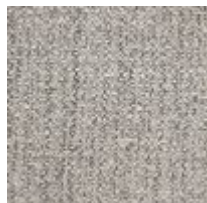
Pillow Fabric: 2-20''' x 20''' Pillows 2867-