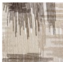
2-20''' x 20''' Pillows 8416-35CC