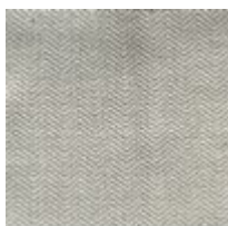
Body Fabric: 2866-34CC-P