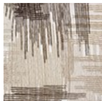
2-20''' x 20''' Pillows 8416-35CC