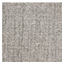
Pillow Fabric: 2-20''' x 20''' Pillows 2867-