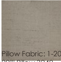
Pillow Fabric: 1-20 ''' x 20 ''' Pillow 3249- 92CC