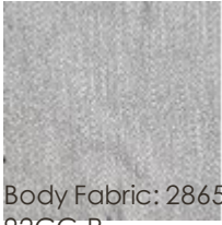
Body Fabric: 2865- 92CC-P Performance