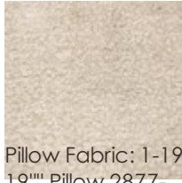
Pillow Fabric: 1-19 mm x 19 mm Pillow 2877-92CC