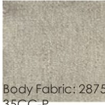
Body Fabric: 2875-35CC-P Performance, Decorative Trim on Frame U00461