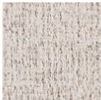
Body Fabric: 4128-30CC-P Performance