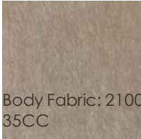
Body Fabric: 21008- 35CC