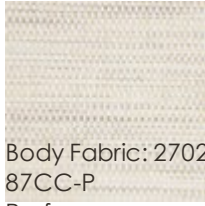
Body Fabric: 2702-87CC-P Performance