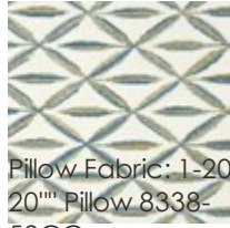
Pillow Fabric: 1-20" x 20" Pillow 8338-52CC