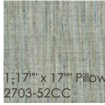
1-17" x 17" Pillow 2703-52CC