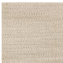
Body Fabric: 2785-35CC