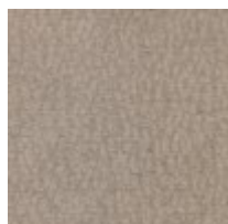
Outside Arm 3127-71CC