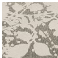
Pillow Fabric: 2-21" x 21" Pillows 5140-