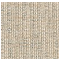
Body Fabric: 2998-