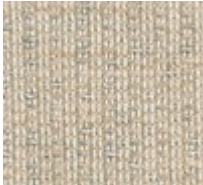
Body Fabric: 2998- 34CC-P Performance