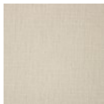
Pillow Fabric: 3-20"x 20" Pillows 2829-