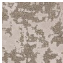
2-20" x 20" Pillows 4116-15CC