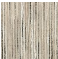
Body Fabric: 6128-77CC-P Performance,