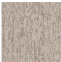
4-24" x 20" Pillows 2886-18CC