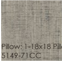
Pillow: 1-18x18 Pillow-5149-71CC