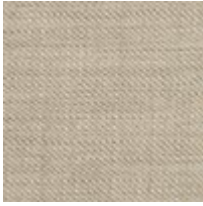
Body Fabric: 2893- 53CC-P Performance