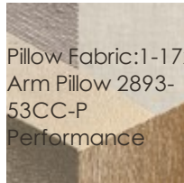
Pillow Fabric:1-17x29 Arm Pillow 2893- 53CC-P Performance