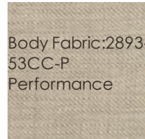
Body Fabric:2893- 53CC-P Performance