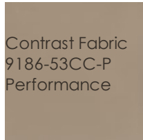
Contrast Fabric 9186-53CC-P Performance