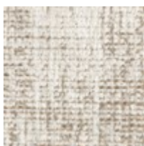
Pillow Fabric: 2- 22" x