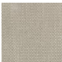
Body Fabric: Outside