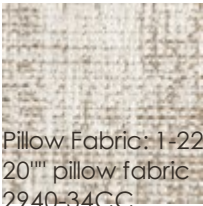
Pillow Fabric: 1-22''' x 20''' pillow fabric 2940-34CC