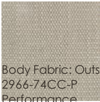
Body Fabric: Outside 2966-74CC-P Performance