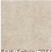
Body Fabric: 2956- 87CC