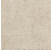
Body Fabric: 2956- 87CC