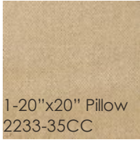
1-20"x20" Pillow 2233-35CC